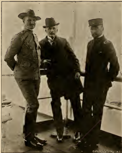
GENERAL FUNSTON, GOVERNOR STANLEY, COLONEL METCALF.

ON BOARD THE TRANSPORT TARTAR, AT SAN FRANCISCO.